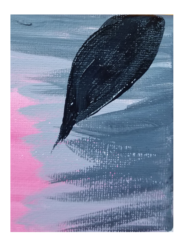
Frame it in with some leafy bois.

Make some branches--not as curvy as the abstracted road. This is about the difference in flow between both lines.