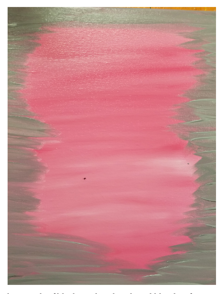
Do the same thing for the edges: load mostly white with only a touch of black on their brush and blend in from the edges. (Two examples so you can see that you can either paint over the pink or let the pink bleed through. Up to the guest.)