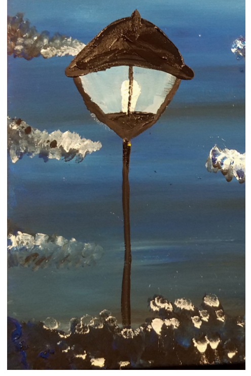
Now with a VERY clean brush they want to paint a pure white oval in the center, then black line down the center to make the metal cage.