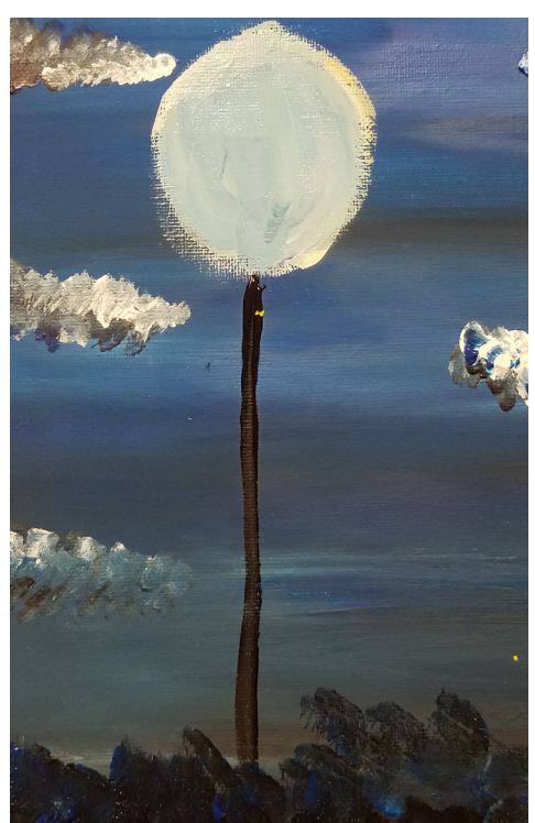
Add a straight line using their round (very cafefully)

Some background blue can and should mix with this. In fact, it's not pure white at all--so if the background is dry they can use a tiny molicule of blue in this step, but hopefully the background is still wet enough to produce this oval's color.