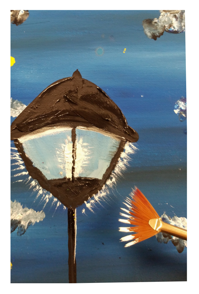
ABOVE: At this point, it's fine if stuff dries. Using a tiny sliver of whie, you want the side of the black bark and black metal to each have a highlight that face each other.

LEFT: make the same highligh in the remaining blue/white area right under the top black metal (see how little and thin it is above the bulb?