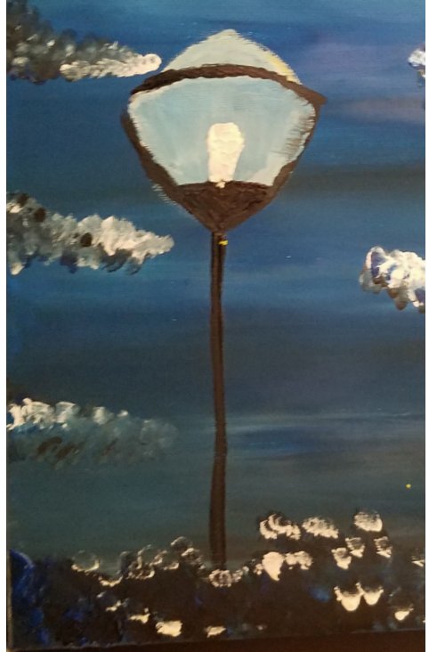
While the black is still on their brush, do a little triangle on the bottom, then outline the bulk of it and give it an even bigger pyramid on top (next step).