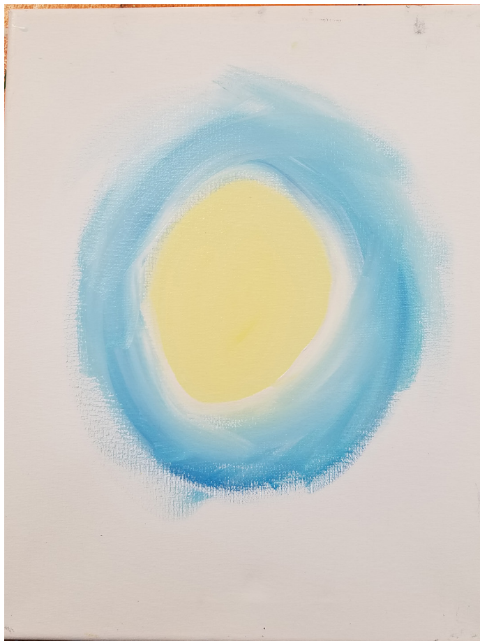
Paint background (You can use all palette colors except save black for foreground image)