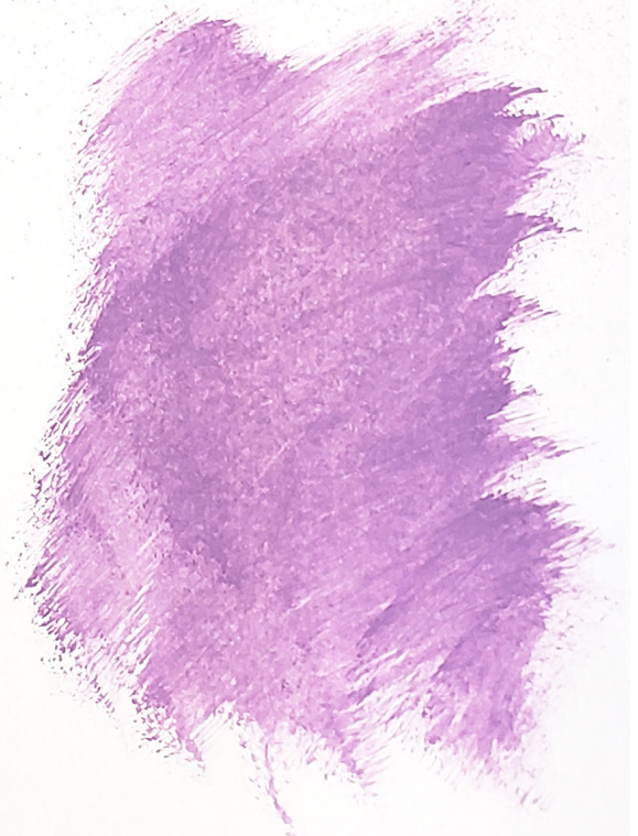
1 color, again not very smooth (applied with the corner of the sponge for texture)