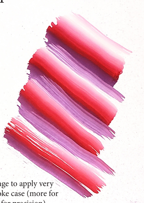
Using a sponge to apply very loose one-stroke case (more for texture than for precision)