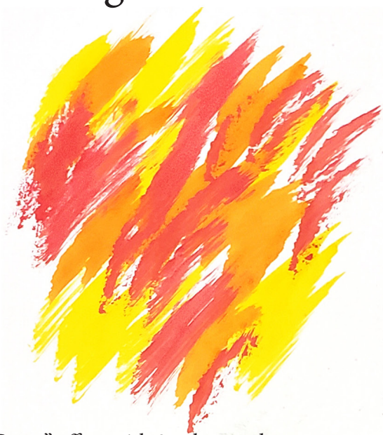
"Camo" effect with 3 colors and the corner of the sponge

Goal is to go be as colorful as possible