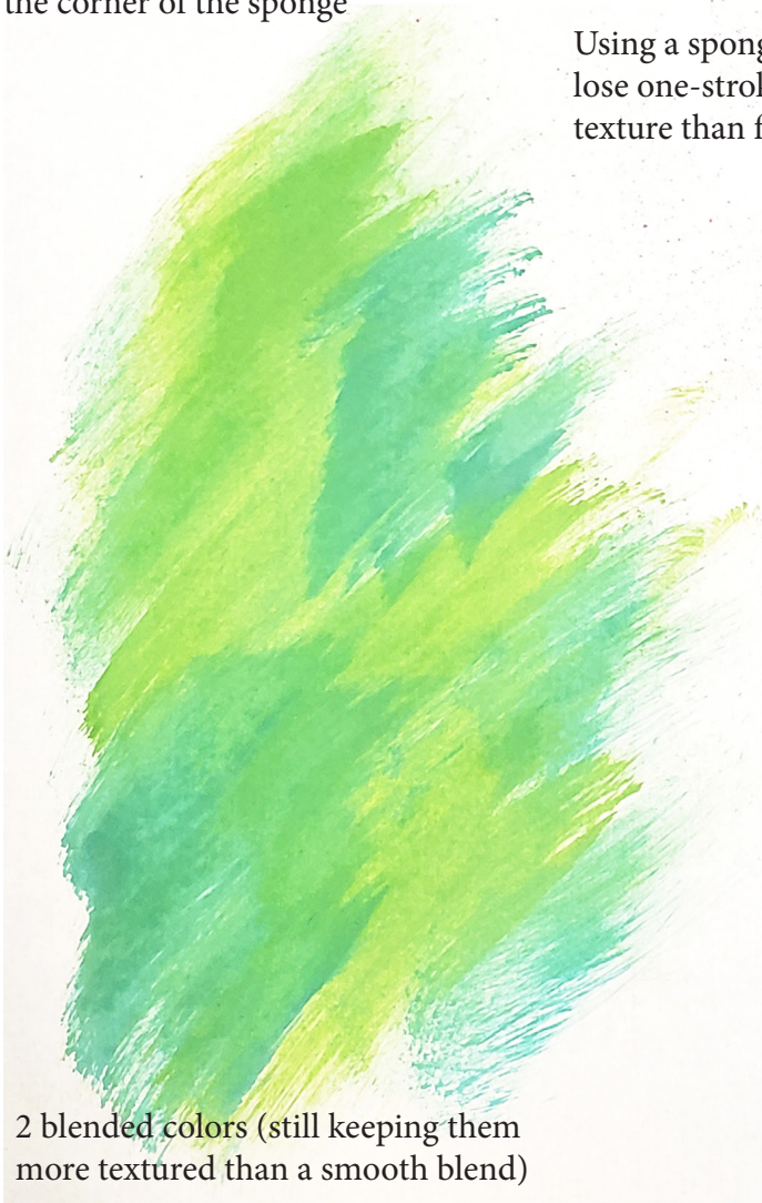
2 blended colors (still keeping them more textured than a smooth blend)